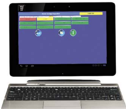
Visual Inspection on a Tablet