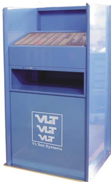
VLT 0845 (Console only)

Monitor TFT-LCD 15" can be connected to Above and / or Under Carriage Keyboard if connected to VL Test Lane software module.