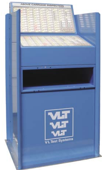
VLT 0845/2 (Console only)